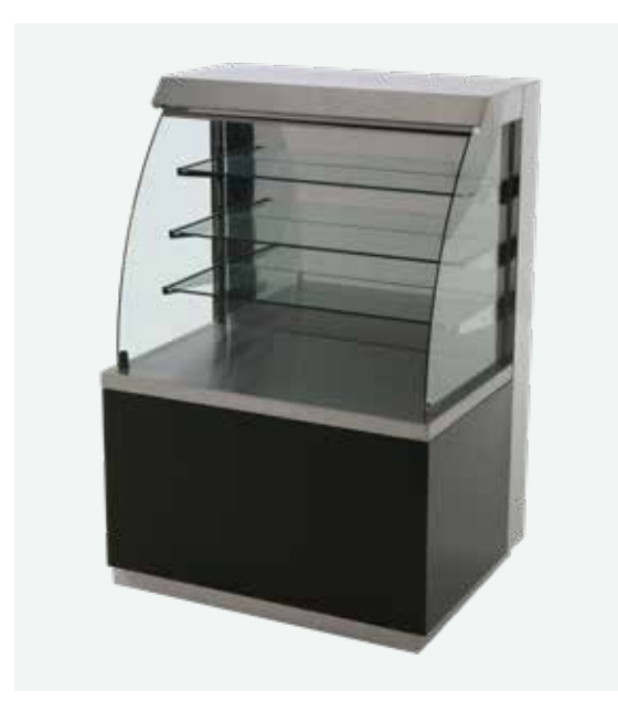
RMA100S WITH BRIGHT SOLID STAINLESS STEEL BACK