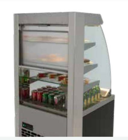
RMR65E WITH LIFT UP LOWER DOOR