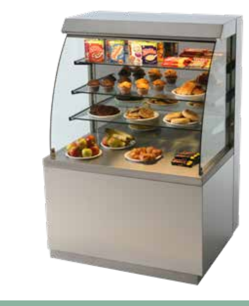
RMA100S WITH PATTERNED RIMEX STEEL BASE PANEL