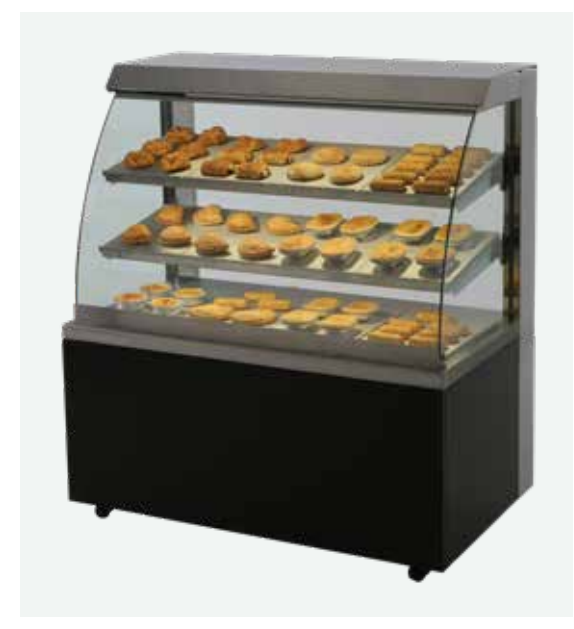
RMH130E WITH BLACK PLASTIC COATED STEEL BASE PANEL