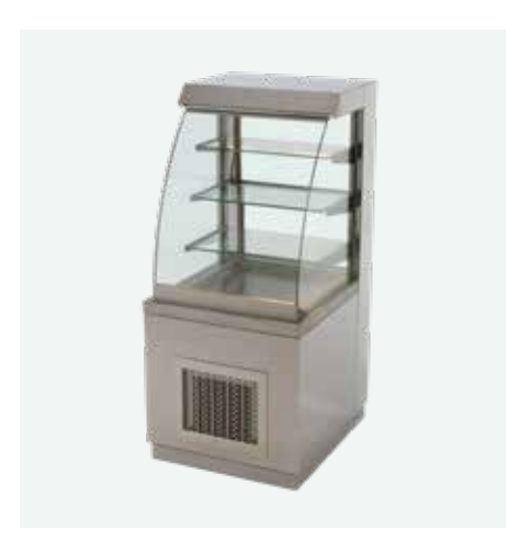
RMA65E OPEN TO REAR