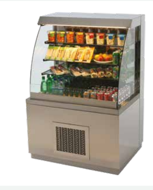
RMR100S WITH SOLID STAINLESS STEEL BACK