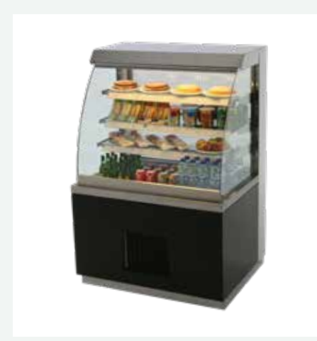
RMR100E WITH BLACK PLASTIC COATED STEEL BASE