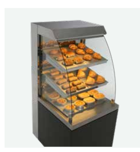
RMH65S SOLID BACK