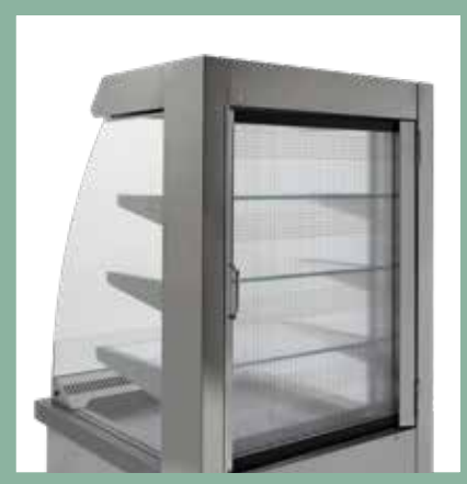
PMP65SP PEAR DOORS

They facilitate the effective presentation of heated and chilled produce whilst maintaining the product temperature.