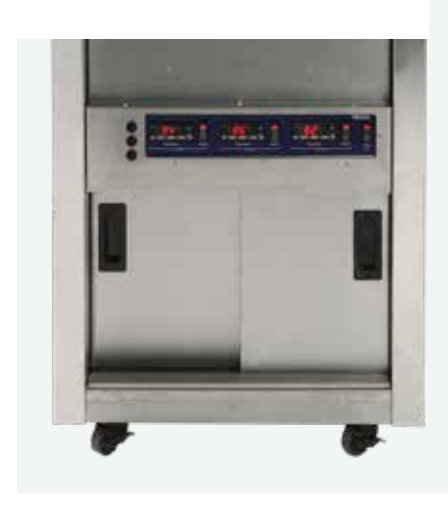
DIGITAL TEMPERATURE CONTROL ON REAR OF UNIT